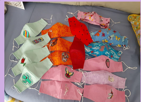
Snow To Sun Community