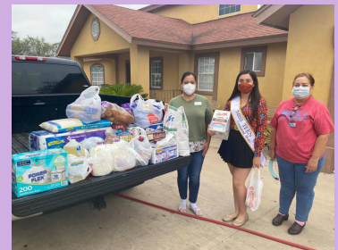
Genevieve's HOPE Foundation