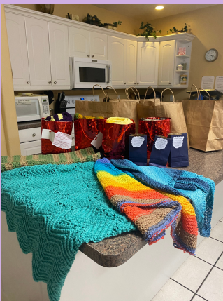
Love of Christ ECLA Lutheran Church

Volunteers continue to contribute to patient care in spite of Covid-19. Our wonderful volunteers have made masks for staff and sold masks which provided donations to Aurora House, made prayer shawls for families, dropped off groceries, and provided landscaping service to beautify our grounds. We truly appreciate your support!