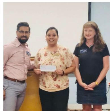
A huge thank you to the Knapp Medical Center and Weslaco Rotary Club for their $15,000.00 donation to Aurora House. We could not have continued to provide our service for over 17 years without our "Village".