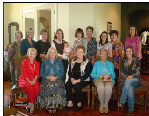
Literary Review Club

Sponsorships and tickets to the Administrative Employees' Day Luncheon and Style Show are still available. Table sponsorships are $1,000, with a half-table sponsorship at $500. Individual tickets are $50 per