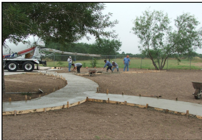
JIII Concrete lays the forms for the walkways which will connect the house with the Memorial Garden for family members and patients to enjoy.