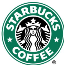
Community Partner— Starbucks of Weslaco

In 2008, after opening their newest store in the Valley in Weslaco, Starbucks employees contacted then director,